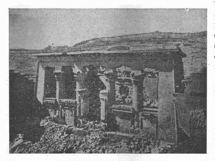
TEMPLE OF KALABSHE, NUBIA

THE small temple of Kalabshe, in Nubia, was built by Rameses II and is an interesting example of one of the greatest ages of Egyptian architecture. While the front part of the building is constructed in the usual manner, the sanctuary and other chambers are carved out of the solid rock. This method is never found in Egypt proper, but frequently occurs in Nubia, and it is a very successful combination. The excavated chambers have an air of mystery and imperishability hardly