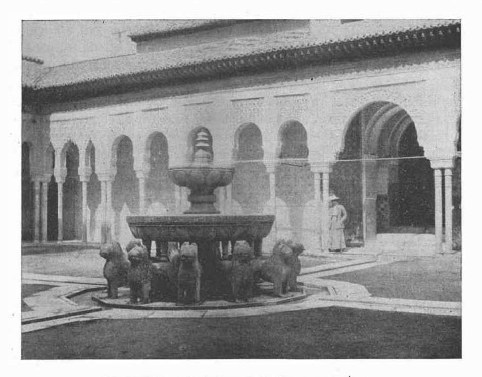
GRANADA: THE 'COURT OF THE LIONS' IN THE ALHAMBRA

THE long period during which Spain was an Oriental nation, prosperous and cultured in the highest degree — an extraordinary contrast to the rest of Europe — accounts for the indescribable fascination and charm that yet exists. It is amazing to find the light and fairylike architecture of the Saracens so near the shores of the Atlantic. Constant efforts have been made by the Christian rulers to blot out the traces and records of the Moslems, but unsuccessfully. The folklore